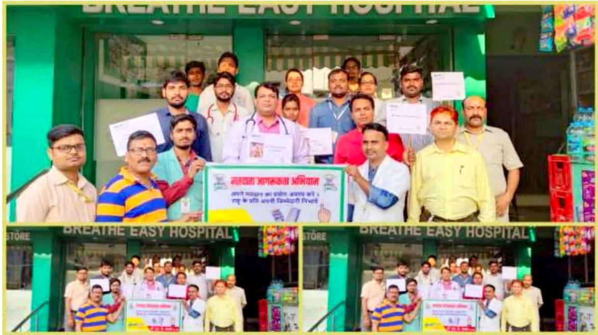
Creating Awareness amongst public for Lok Sabha Voting 2019