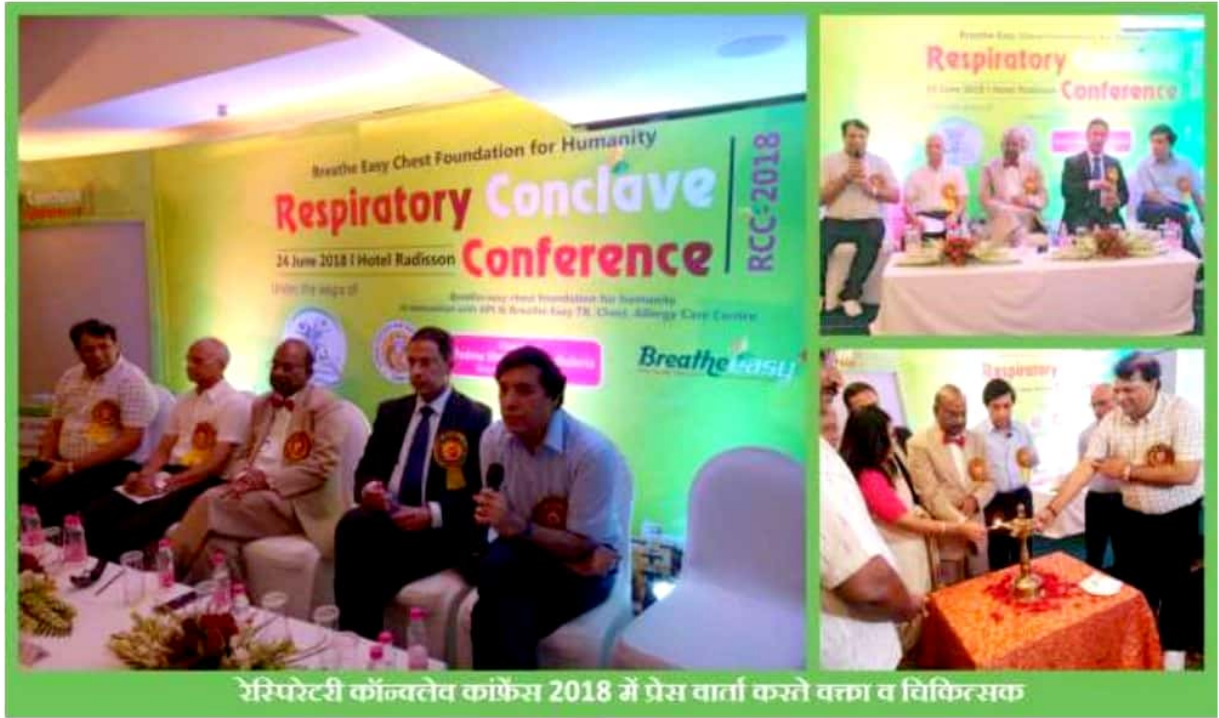
रेस्पिरेटरी कॉन्क्लेव कॉन्फेंस 2018 में प्रेस वार्ता करते वक्ता व विफिट्सक