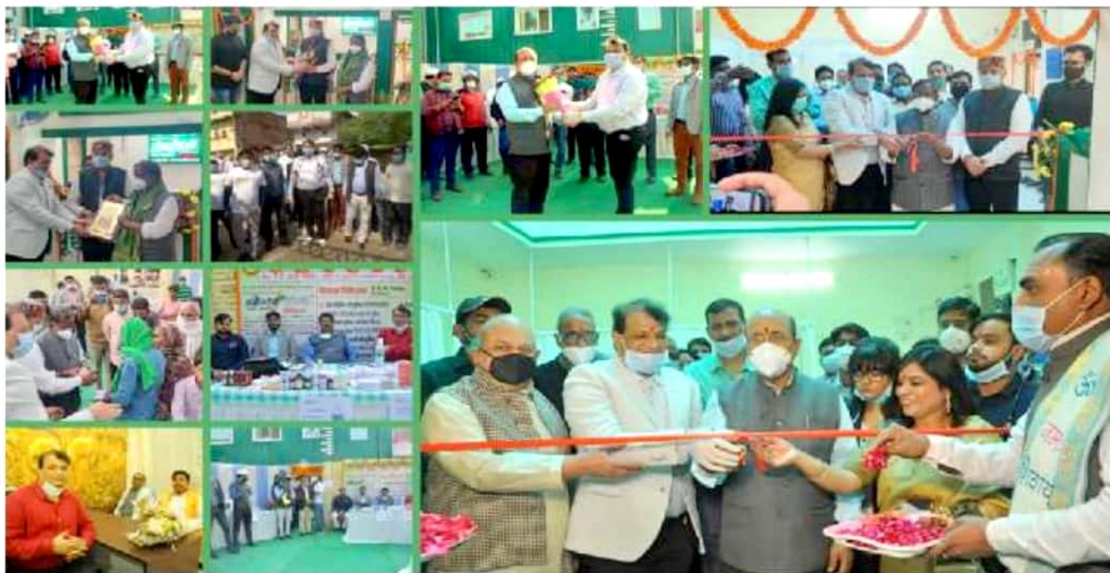
Breathe Easy Multi Specialty Hospital, Ramnagar Opening Snaps & Collage