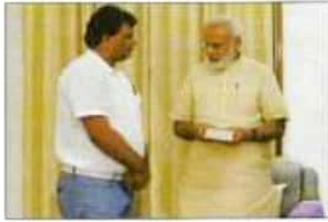
डी नरेन्द्र मोदी जी, भारतीय प्रधानमंत्री से मुलाकात करते