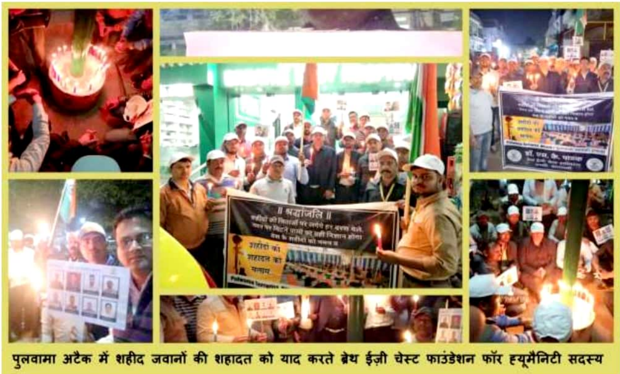
पुलवामा अटैक में शहीद जवानों की शहादत को याद करते ब्रेथ ईज़ी चेस्ट फाउंडेशन फॉर ह्यूमैनिटी सदस्य