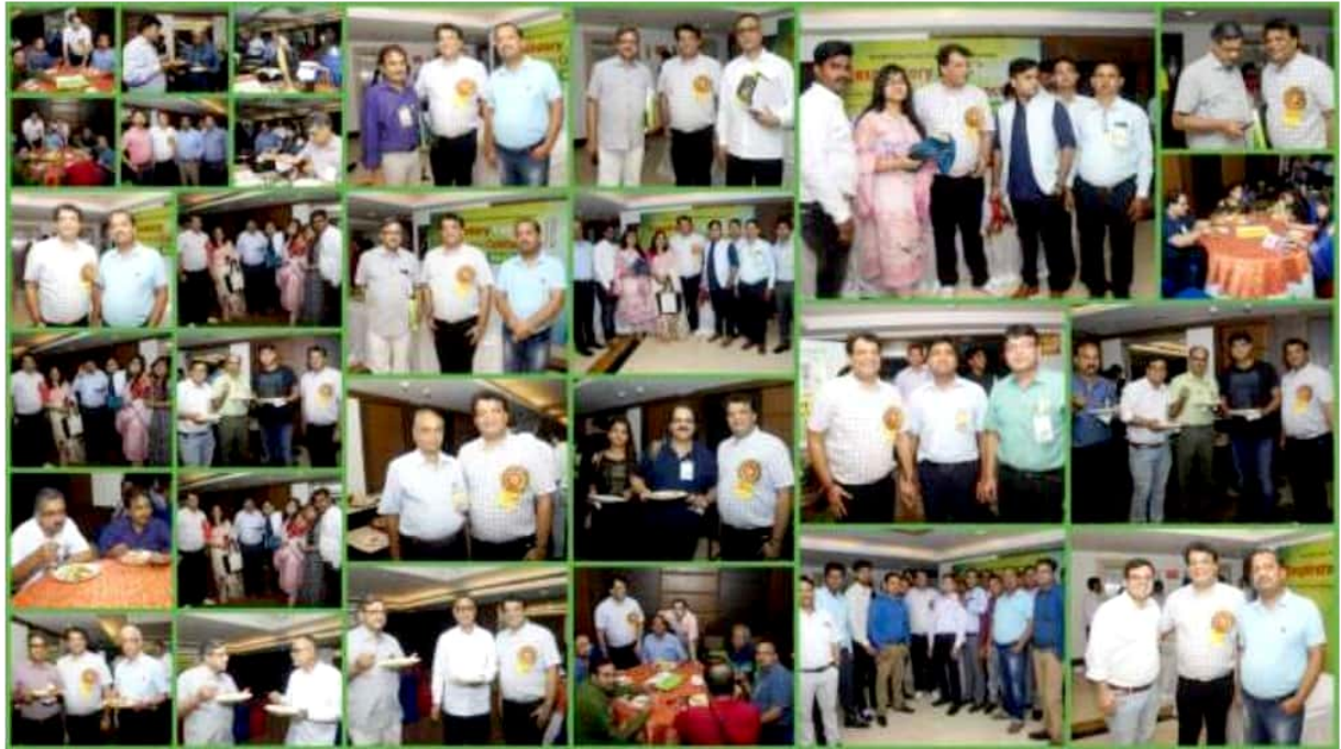
Faculties, Pannellists, Attendees during dinner - Respiratory Conclave Conference 2018