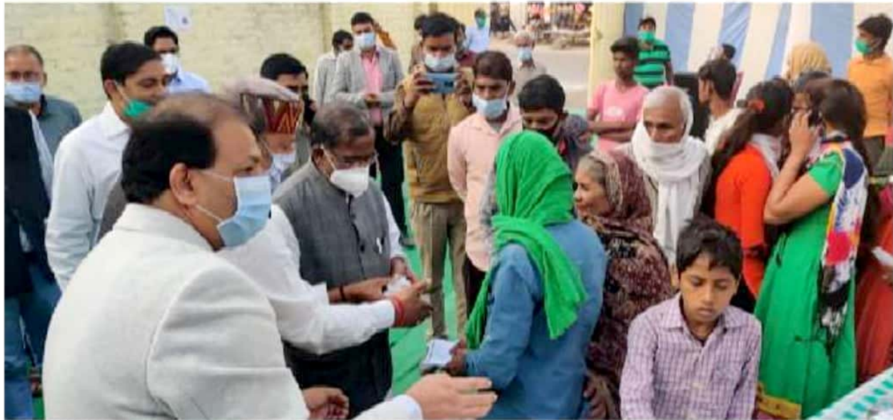
ब्रेथ ईजी चेस्ट फाउंडेशन फॉर ह्यूमैनिटी की तरफ से रामनगर में निःशुल्क चिकित्सा शिविर