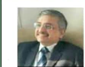
Padm Shri Dr Randeep Buleria Director - AIIMS

Management of Dyspnoea in COVID-19 Pandemic